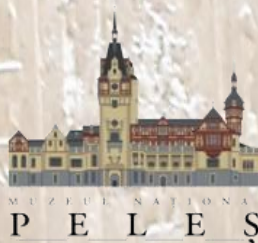
MUZEUL NAȚIONAL PELEȘ